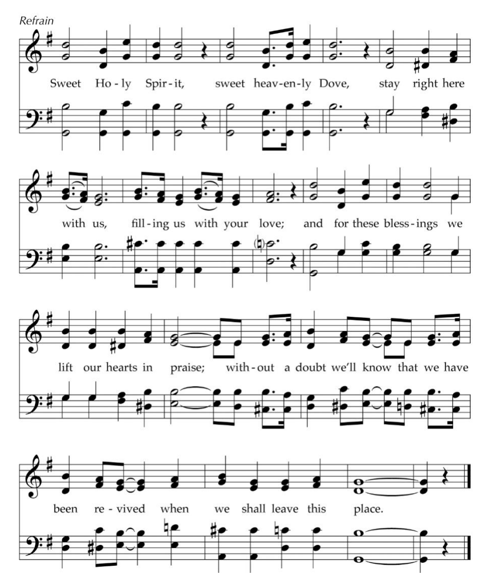
Charge and Benediction